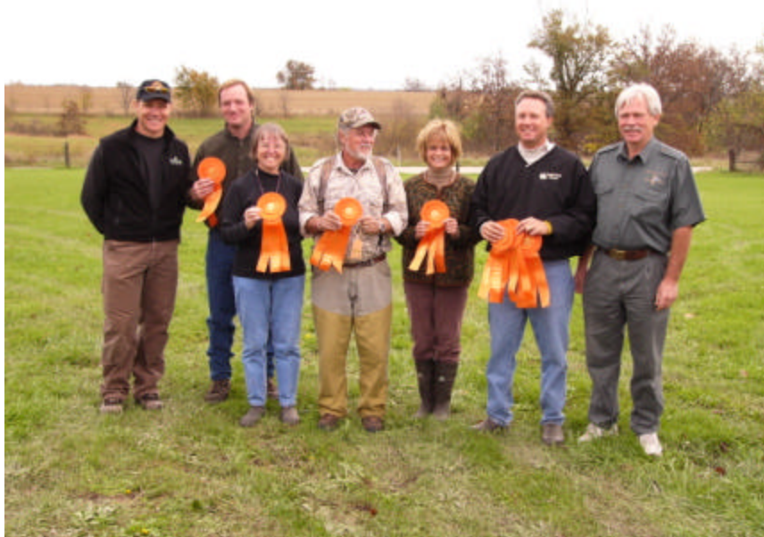
Master Stake Qualifiers at the Conclusion of the KCRC Hunt Test Held October 30 th & 31 st at Blackwater Retrievers. Centerview. MO.