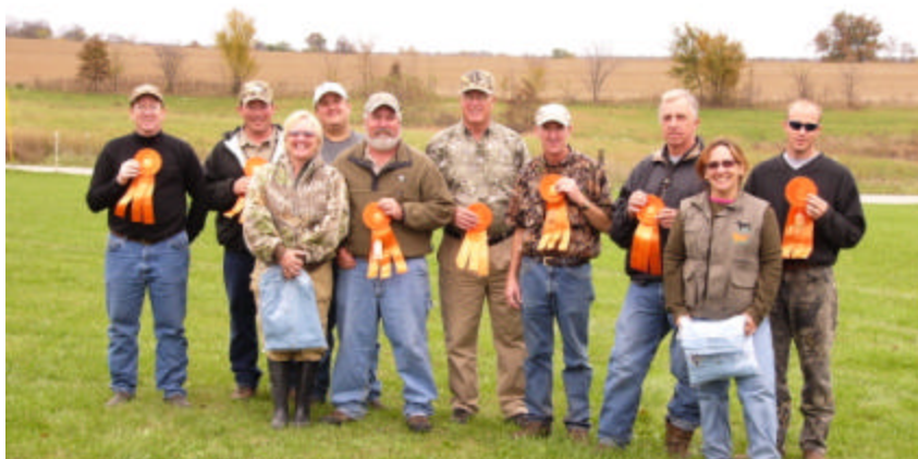
Senior Stake Qualifiers at the Conclusion of the KCRC Licensed Hunt Test